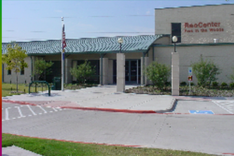
Constructed Park in the Woods Recreation Center with 2003 Bond Program funds