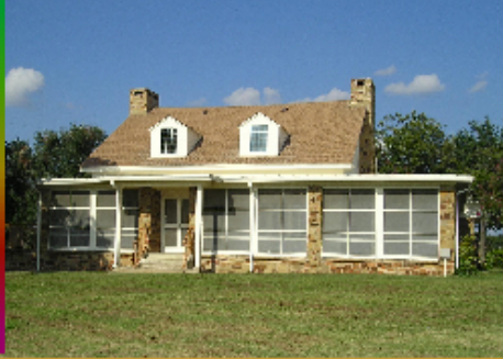
Restored Winfrey Point with 2003 Bond Program funds