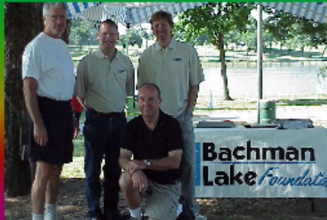
Park pavilion renovation made possible by generous donation from The Bachman Lake Foundation