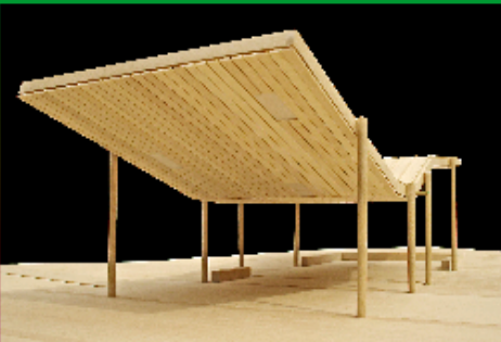
Designed Ridgewood Park Pavilion with 2003 Bond Program funds