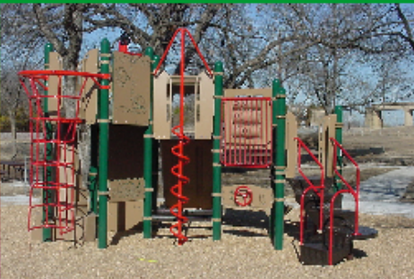
Constructed Tama Park Playground with 2003 Bond Program funds