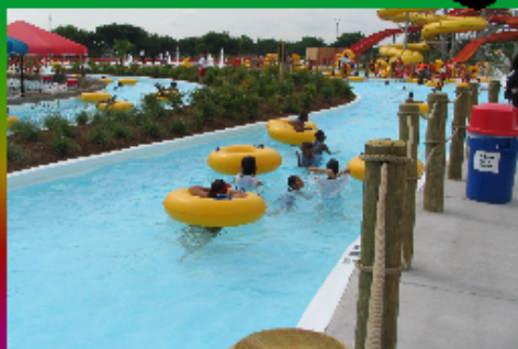
Constructed Bahama Beach Family Aquatics Center with 2003 Bond Program funds