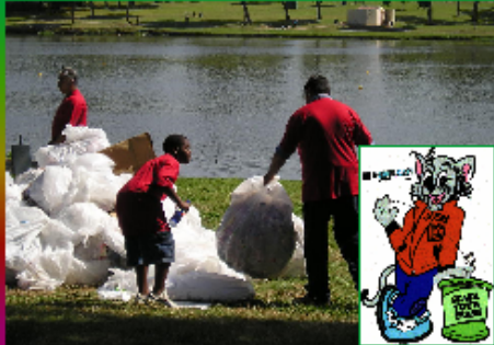
Communities Against Trash Campaign Kick-Off at Bachman Lake